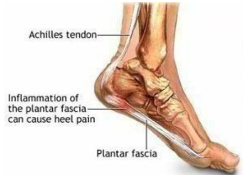
COMMON AREAS OF PAIN FOR PLANTAR FASCIITIS

This can be caused by different things, which include increased exercising, tightness in calves, poor shoes, and hard flooring. Symptoms typically worsen with activity and improve with rest.